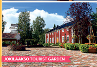
JOKILAAKSO TOURIST GARDEN