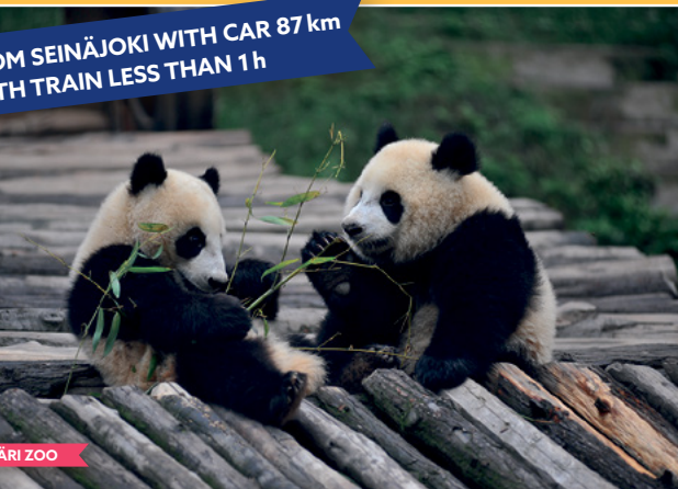
FROM SEINÄJOKI WITH CAR 87 km WITH TRAIN LESS THAN 1 h

hoinaalla = hang out trahteeri = service friskata = to refresh havaata = to notice pyörtää = to return umpeloanen = potato flataanen = bad julumettu = huge ka = nice to see you pöhänä = to be drunk