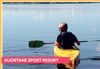
KUORTANE SPORT RESORT