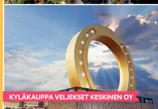
KYLÄKAUPPA VELJEKSET KESKINEN OY