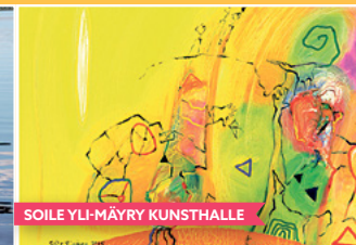
SOILE YLI-MÄYRY KUNSTHALL